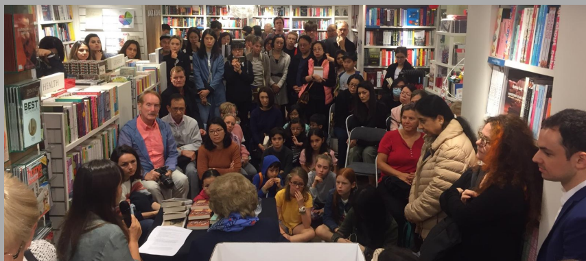
Bookazine Book Signing