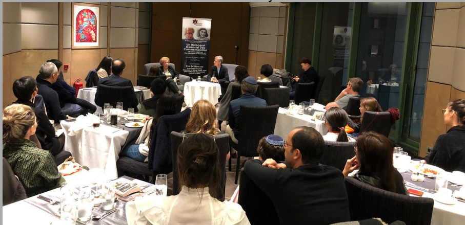
Jewish Community Centre