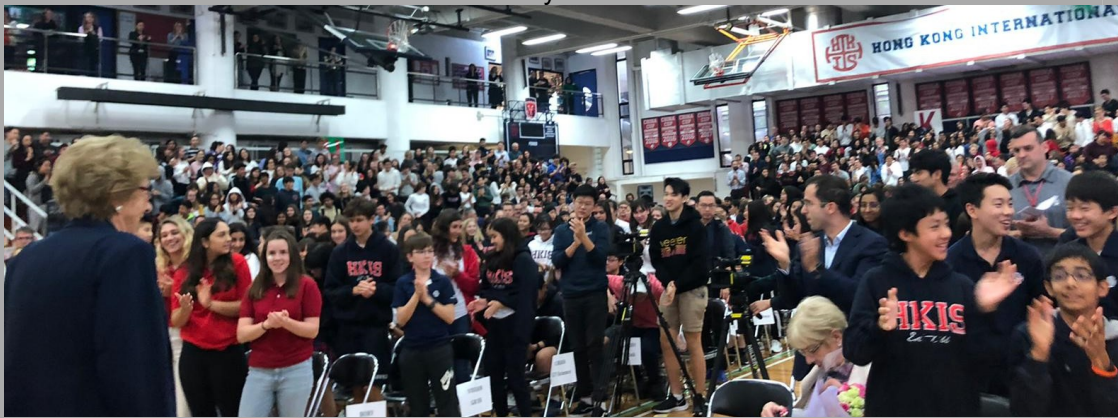
Hong Kong International School