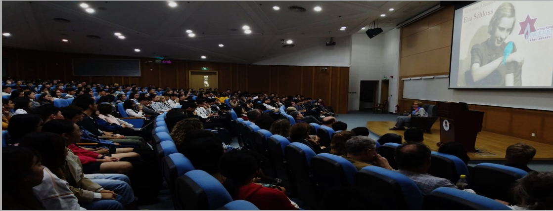
University of Macau