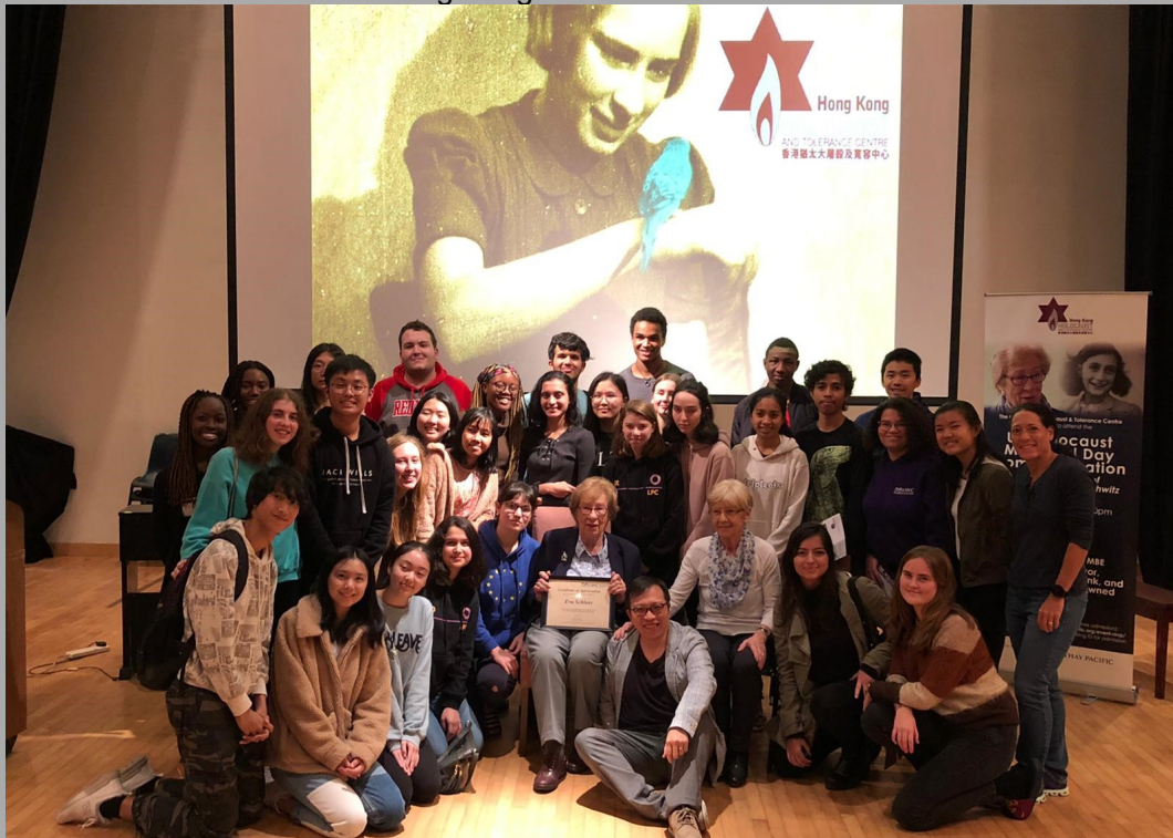
Li Po Chun United World College of Hong Kong