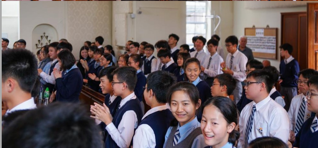
St. Stephen's College